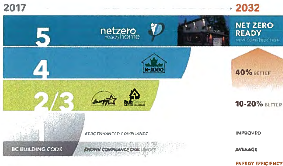
Image: How the BC Energy Step Code for Part 9 buildings relates to green building rating systems