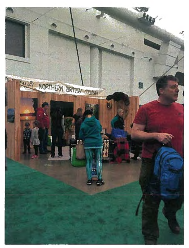
The booth during the Show. The cedar smell of the booth was remarked on over and over.