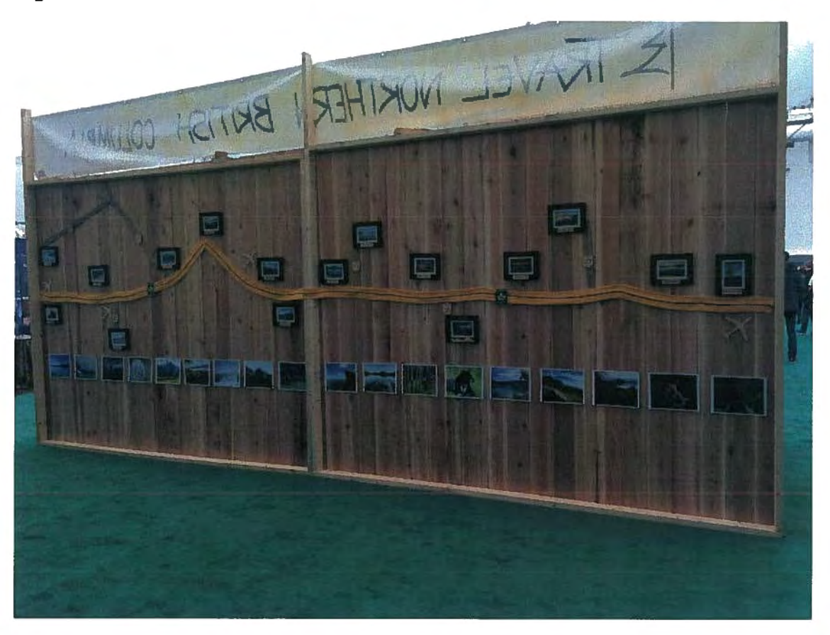
Highway display on the back wall of the booth.

There is value for the RDBN to continue to attend the Vancouver Outdoor Show as part of the Travel Northern BC group. Northern BC is a large area and the geography and specific locations within the area are not well known to booth attendees. Someone may only have heard about Prince Rupert and stop at the booth because of this. There is the opportunity then to expand their knowledge base of the area. This same person may not stop at a Bulkley-Nechako booth. From a partnership point of view building relationships with others in the tourism industry is very important in the success of marketing our region.