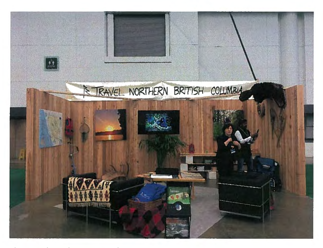
The Travel Northern BC Booth. Tourism Smithers is teaching Tourism India about our bears.