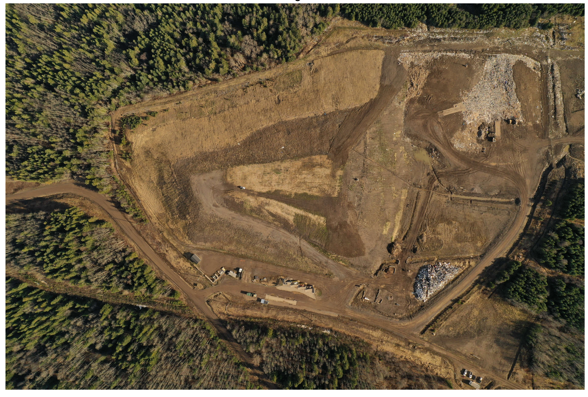
Figure 2. Knockholt Landfill May 1, 2020.